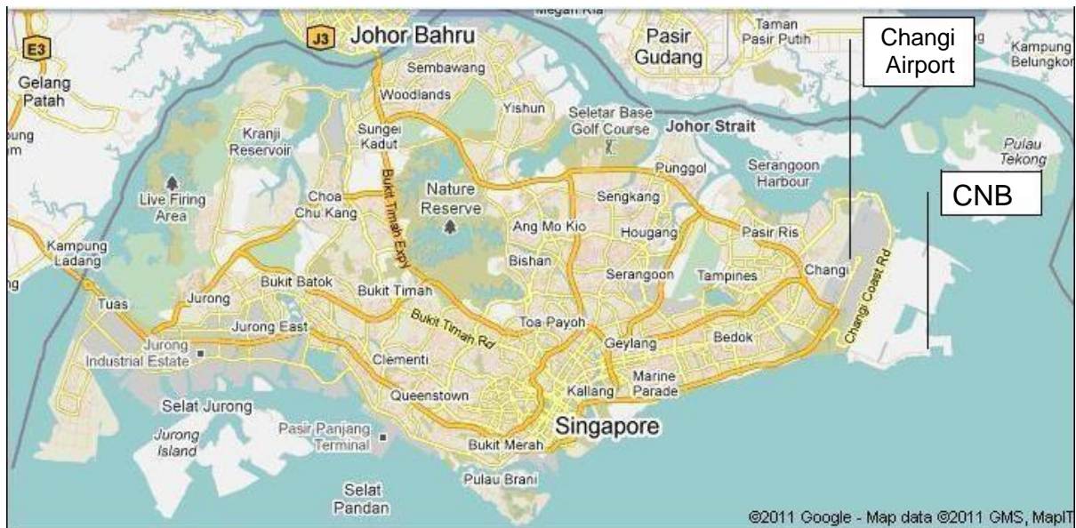
Figure A1: Location of CNB

1. CNB is located at the eastern end of Singapore. CC2C is the building in CNB located near the entrance ( Address: Changi Naval Base, 103 Tanah Merah Coast Road, #02-01, S498750 ). The location of CNB and CC2C are shown in Figure A1 and Figure A2 .