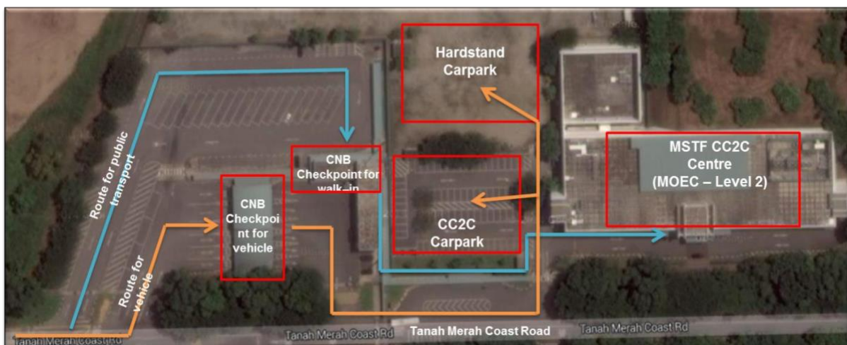
Figure A2: Location of CC2C